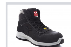
S000 TOTAL BLACK