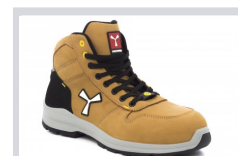
S0100 GIALLO ASPEN